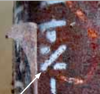
API 5L Grade X42 piping